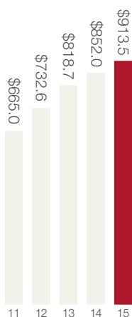
Net Sales (in millions)