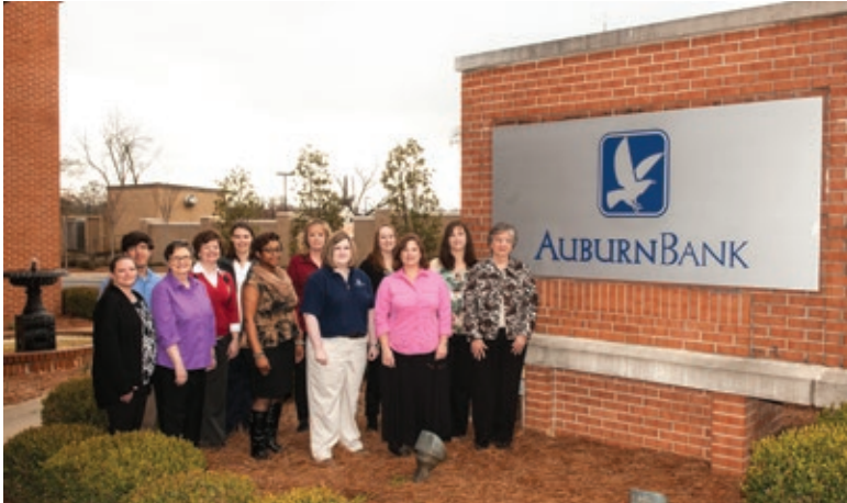
Loan Operations Team

enables customers to deposit checks, pay bills, and transfer funds. All of these services also require superior operational support to ensure complete customer satisfaction.