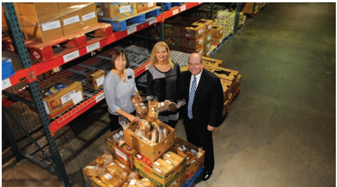
Supporter of Food Bank of East Alabama