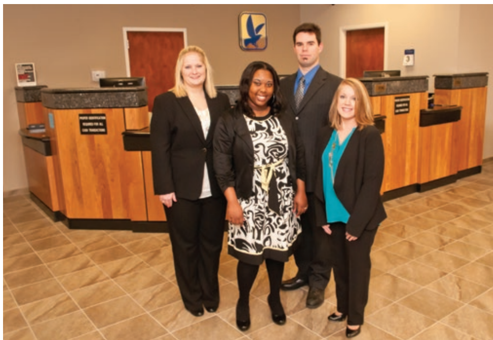
Come visit us at our Corner Village Branch.