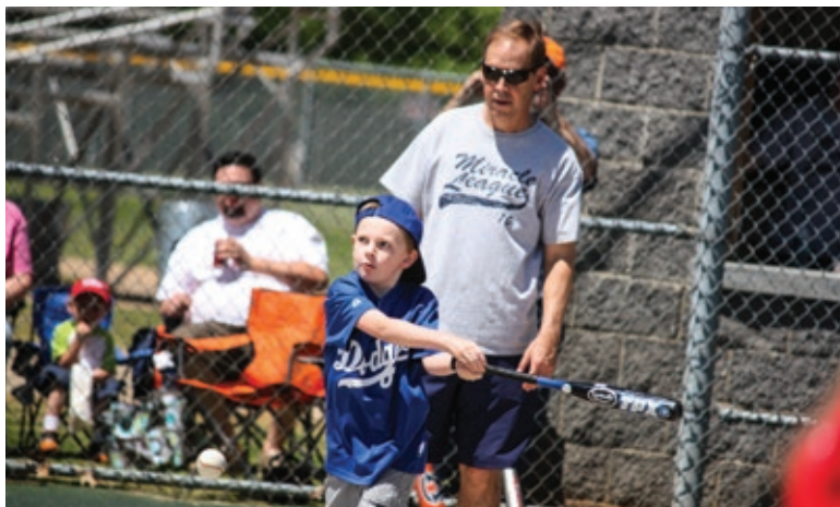
Supporter of Miracle League

organizations, thus enhancing the quality of life for all citizens in our community. As we continue our journey of service in 2015, the entire AuburnBank team extends its sincere appreciation to all of our customers and shareholders for a successful 2014. We look forward to continuing to be your partner, your neighbor and your friend for many more years.